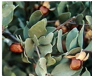
JOJOBA ( Simmondsia Chinensis )

Jojoba oil is high in vitamins. Actually a wax more than an oil so provides protection. Reduces moisture loss from skin, rapidly penetrating. Jojoba oil is in the following Skinflint products: