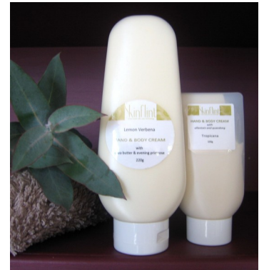
Hand & Body Cream